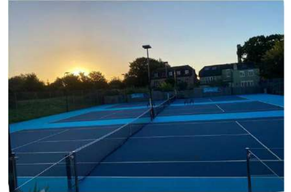
Our beautiful Matchplay II courts 1-3 at sunset

As part of this project, we've taken the opportunity to take a fresh look at different surfaces and decided that the Matchplay II surface on courts 1-3 is the still best choice for our club. Matchplay II is an all weather, British manufactured, high performance tennis surface that offers maximum comfort underfoot.